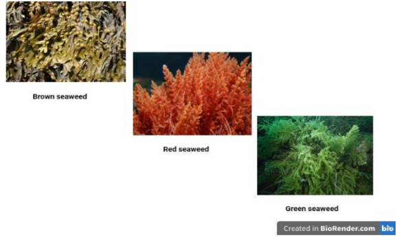
Figure 2: Three Types of Seaweed

sectors, including the cosmetic formulation industry for the creation of emulsifiers, moisturizers, thickening agents, and hair conditioners (66, 67). Nine to thirty-six percent of the dry weight of ulvan biomass is usually present (68). This SP has sulphated rhamnose, glucuronic acid, iduronic acid, and xylose in addition to uronic acid linked to a sulphated neutral sugar in a repeating disaccharide structure. Ulvan may find application in a range of fields, such as medicine, agriculture, and the development of substitute biomaterials, due to its antioxidant qualities (67).